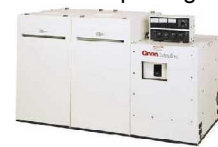
Onan Optional Sound Shield