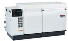
Onan Optional Sound Shield