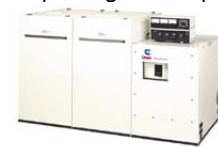
Onan Optional Sound Shield