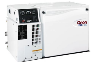
Onan Optional Sound Shield Model pictured has optional gauges